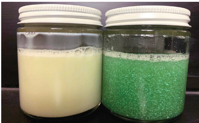
Jar test highlights the difference between Viloprid FC 1.7 (left) and Admire® Pro mixed with liquid fertilizer. Viloprid FC 1.7 mixes perfectly, making it easier to get the benefits of trusted insect control at the same time as the nutritional benefits of liquid fertilizer.