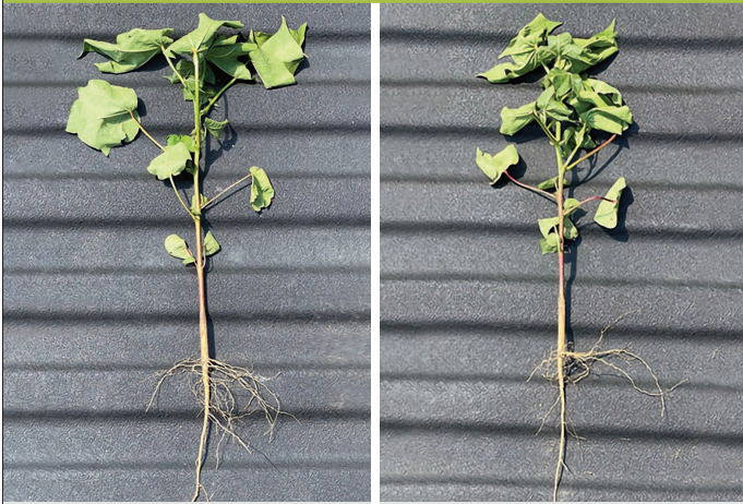
Averland® FC + Viloprid® 4